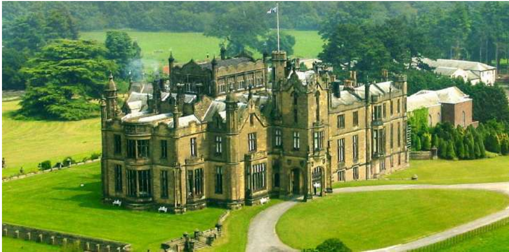
Allerton Park – Yorkshire, England. HQ - No.6 (RCAF) Group, Bomber Command